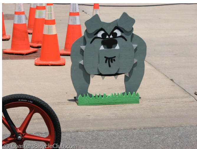
A mean dog stands guard in the Paperboy contest.

We were working on bike racks to encourage biking in Delano so we decided to do an event focused on cycling. Along with the Coasters , the Oz Bicycle Club and several area bike shops, we came up with Pedal Mania!