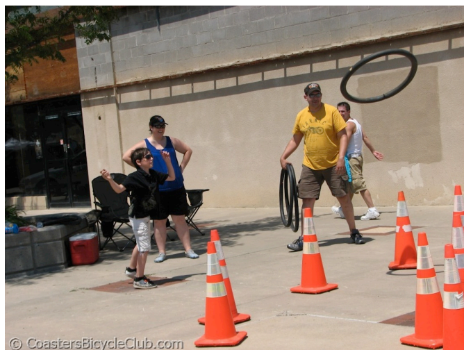
Players try to hook the cones in this Bicycle Ring Toss.

in October of 2010 we were approached by Wichita Festivals, Inc. to create an event for RiverFest 2011 . We could choose any type of event we wanted. How could we resist?!?!?